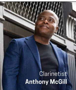
Clarinetist Anthony McGill